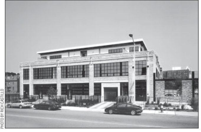
Archive Design Studio, Detroit, turned a 1920s industrial building into condominium loft units.