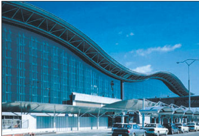
Architecture takes flight at Sendai International Air Terminal, Sendai, Japan