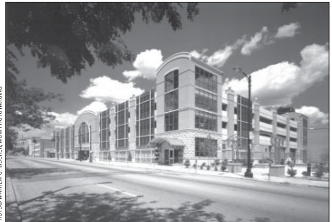
The YMCA Garage, Metropolitan Offices and Wellness Center Addition by Presnell Group, Louisville, earned a Merit Award from AIA Kentucky