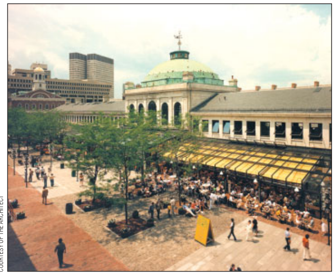
Quincy Hall at Faneuil Hall Marketplace is a "precedent for adaptive re-use with global influence," according to the jury.