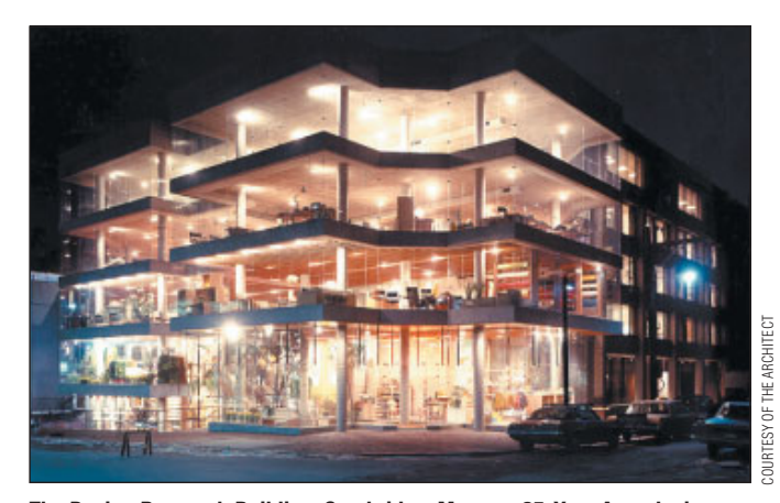
The Design Research Building, Cambridge, Mass., a 25-Year Award winner.