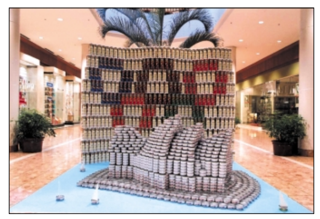
"OlympiCan," by Jacobs, St. Louis, received an honorable mention for its rendition of the Sydney Opera House standing proudly before the Olympic flag.

CANSTRUCTION® is trademarked and organized by the Society of Design Administration, which partners in cities with chap-