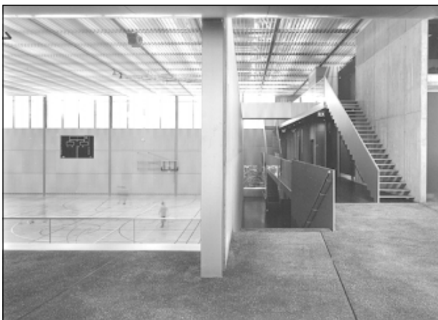
Sports facility in Magglingen, Switzerland by Bauzeit Architects.