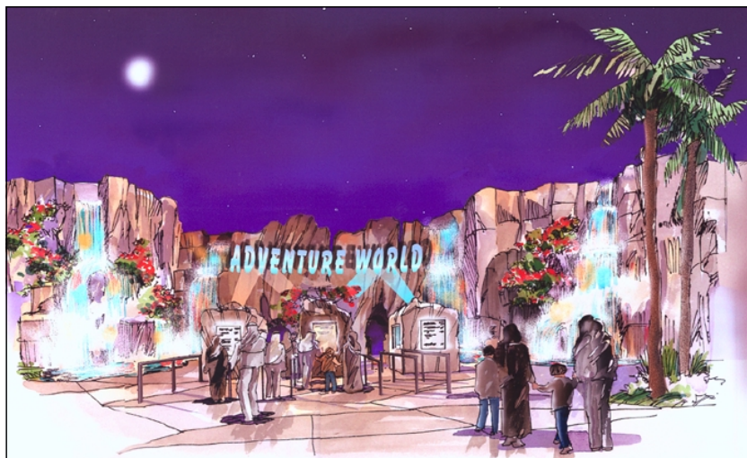
Adventure World, Jeddah, Saudi Arabia, by JPI Design.

terior design, to Wimberly Allison Tong & Goo, Honolulu