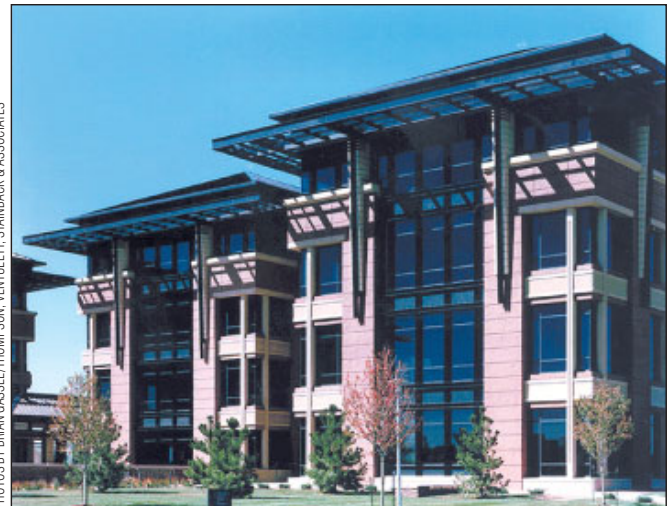
Merrill Lynch Operations Facility, Englewood, Co.