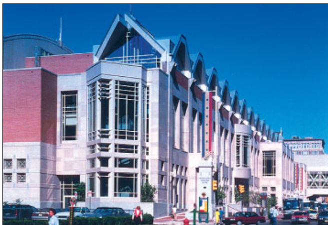
Above and far right, Pennsylvania Convention Center, Philadelphia.