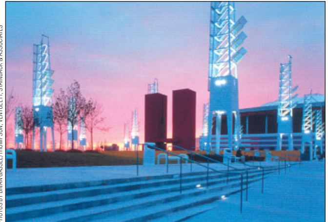
Georgia International Plaza, Atlanta.