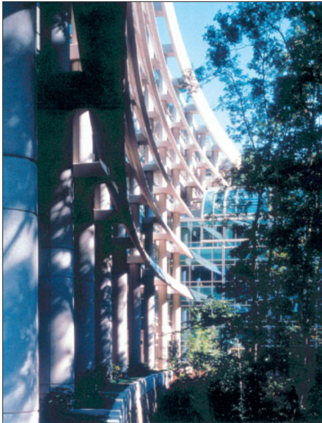
United Parcel Service World Headquarters, Atlanta.