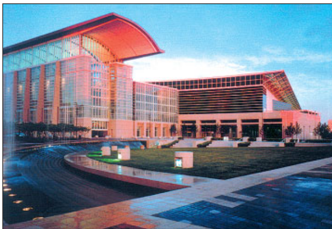
McCormick Place Expansion, Chicago.

Founded in 1968, Thompson, Ventulett, Stainback & Associates quickly established itself as a leading architectural firm in the Atlanta area by designing the Omni/CNN Center and the Georgia World Congress Center. Recognizing the advantages of having a diverse practice, TVS expanded into the markets of