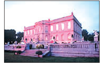
The Elms Mansion, Newport, R.I., past recipient of a Friends of Vieilles Maisons Françaises restoration grant, recently celebrated its centennial.